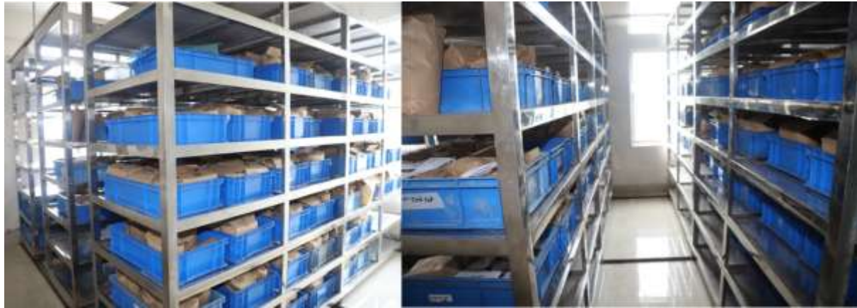
Figure 5. Modern facilities for storage of breeding germplasm are in use in the breeding program