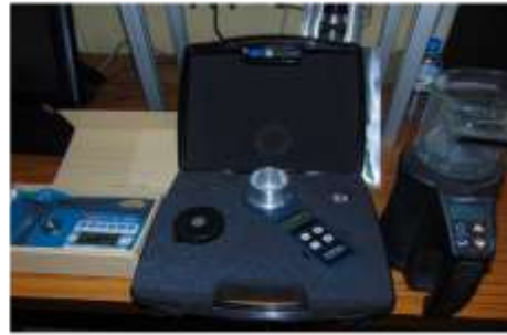
Figure 4. Automation equipment are in use for digitized data recording