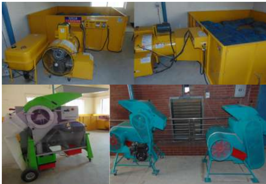
Figure 3. Modern threshing and drying equipment are in use in the breeding program

In the coming future, using these outcomes and other emerging innovative ideas, e.g. speed breeding, haplotype breeding, bioinformatics, phonemics, artificial intelligence, precision agriculture will enrich the inception of 3 rd Green Revolution in the world.