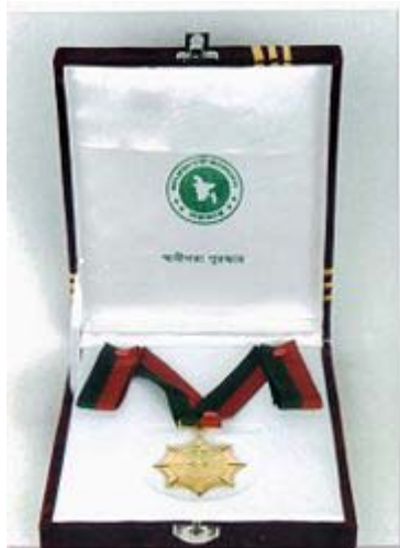
The gold medal

Independence Day Award (Bengali: স্বাধীনতা দিবস পুরস্কার)